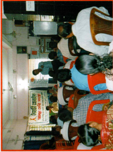
DOTS Awareness Meet with RMP Doctors

By our near-2-decade of practice and learning we have equipped our staff with lots of awareness raising measures and tools, like conducting street dramas, street magic shows, community meetings to prepare volunteers, making govt staff aware of the depth and magnitude of different problems and so on so forth.