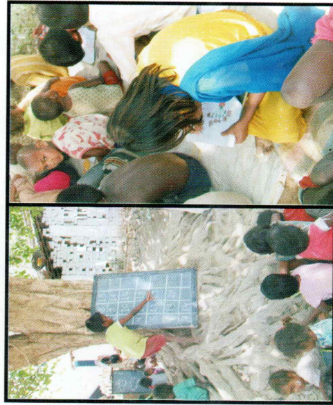
A Migrant Student showing Numbers to 'class' mates & a scene of the 'Drawing Class'

Then we confronted the case of literacy drive and education to migratory children of seasonally migrant labourers at the brickfields, children who are 1st gen learners and live in a harsh environ. We took the challenge.