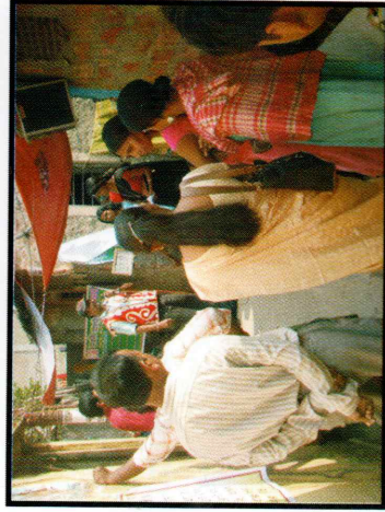
A Street Magic Show for HIV/AIDS Awareness

Our organisation is one of the oldest & closest partners of WB State AIDS Prevention and Control Society. We are in this field since 1995.