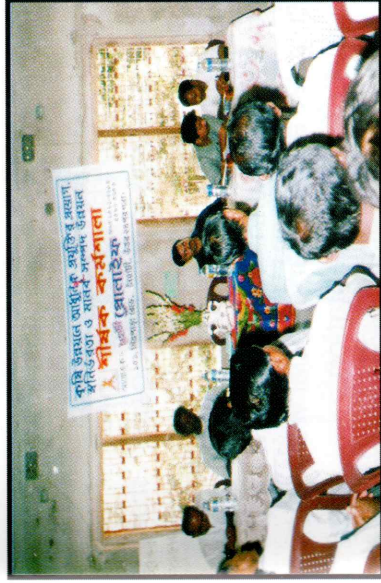
A Meeting with Farmers on Organic Farming

We have conducted workshops with farming communities on pest control by means of friendly insects; vermiculture promotion for soil remediation; etc.