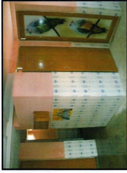
Girls' Change Rooms installed